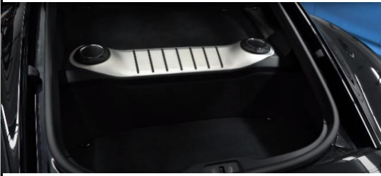
5.open the trunk lid