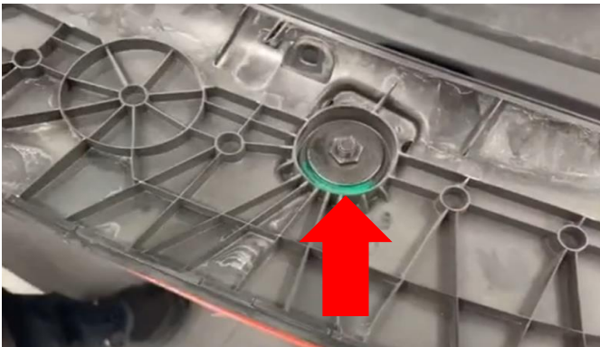
3.Use a marker to mark the location of the fixing screws