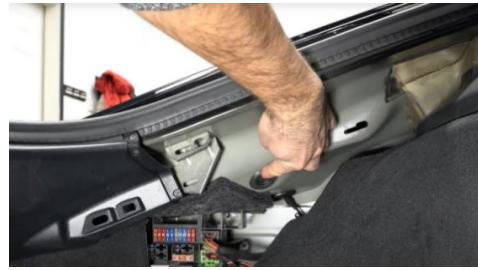
6.remove the plug