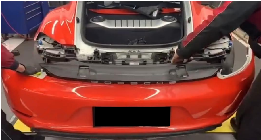
12.remove rear bumper