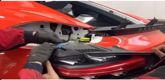
9.Remove the tail lights, use a plastic crowbar to open if necessary