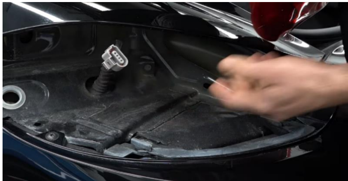
10.Remove tail light plug