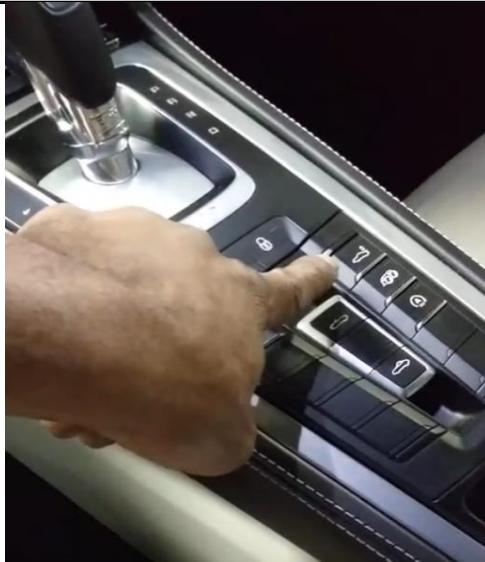
1.raise the spoiler