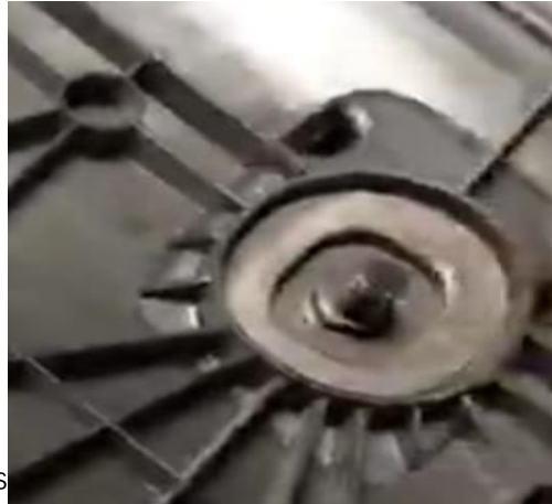
4.Remove the fixing screws and remove the spoiler