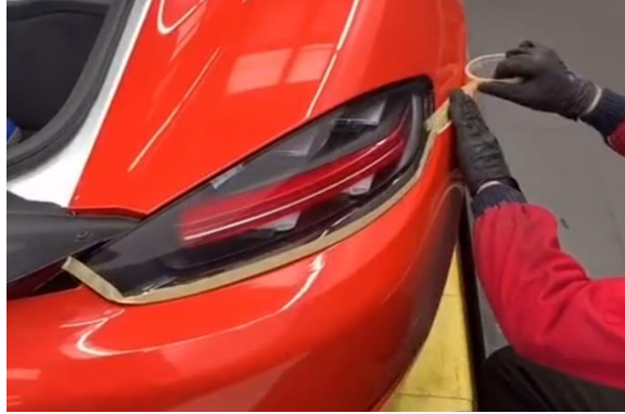
8.Protect with masking tape