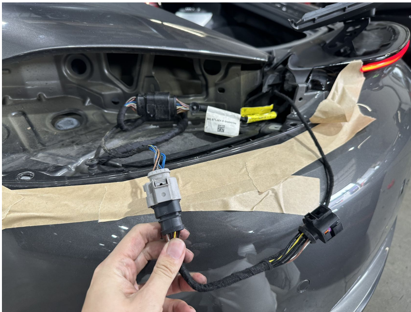
14.Use a non-destructive plug to connect to the rear light interface