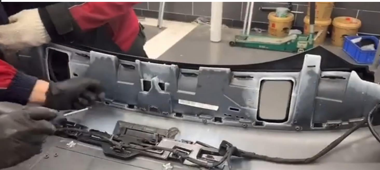
13.Replace the original car rear wing base