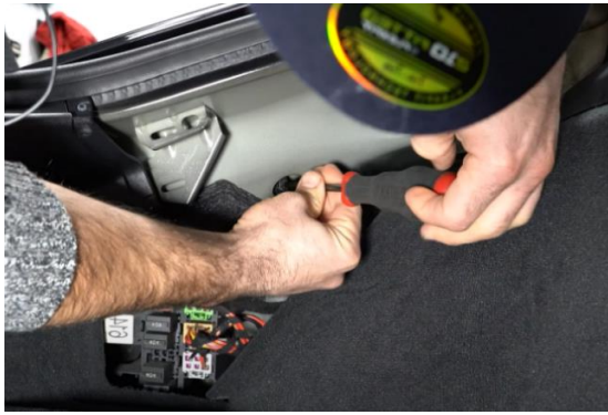
7.unscrew using a T30